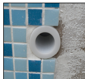
The 5 mm lip allows tile or render to be applied without covering the pipe work inserts into pipe work