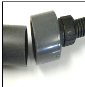
Pipe inserts in to conduit