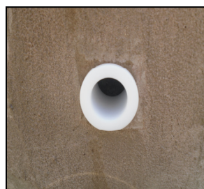
Adaptor inserts into pipe work