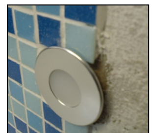
Finally the lamp is inserted into adaptor, giving a flush finish