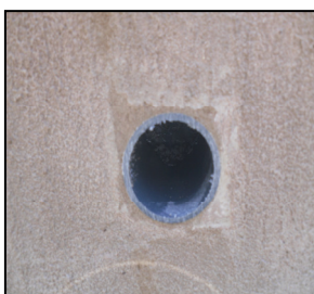
Pipe work concreted into pool wall