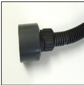
End cap with IP67 conduit